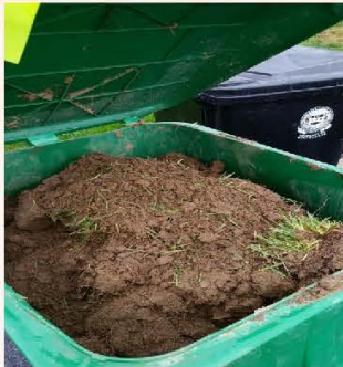
No dirt in the can