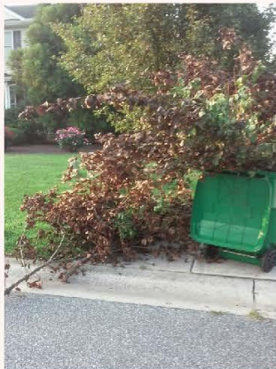
Branches of inappropriate size