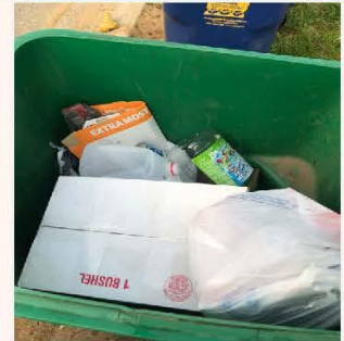
No trash in the can