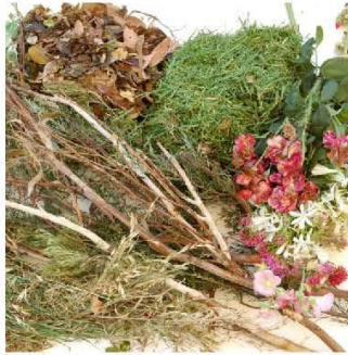
Shrubs, Twigs, & Weeds placed loose in the can