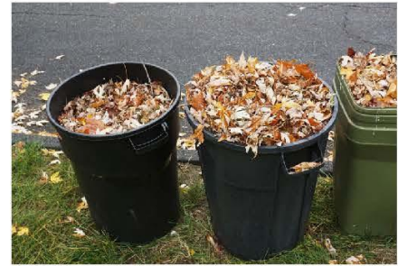
Additional personal can—maximum 32 gal