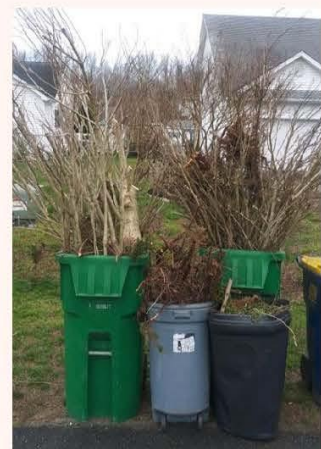
Lid must close

For more Information or questions, please call: (302) 744-2429