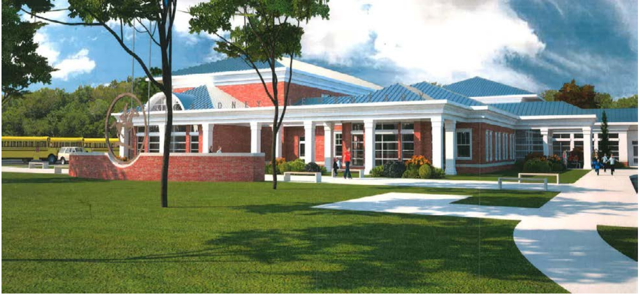
( full rendering attached to photo)