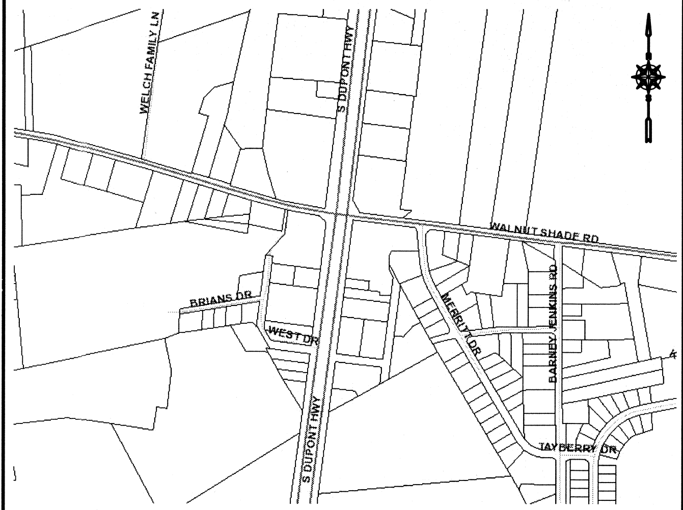
LOCATION MAP SCALE: 1" = 500'