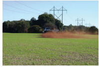
Applying Kentorganite to a local farm.